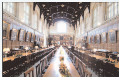
The Great Hall, Christ Church, Oxford

If you would like to attend this event, please call the Oxford Philomusica on 0870 60 60 804 for more details or email events@oxfordphil.com