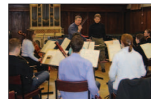
Coaching University students

OP's long term relationship with the University is cemented through its position as the official Orchestra in Residence. As part of this collaboration the OP offers a variety of masterclasses and workshops throughout the academic year with leading artists and practitioners at the Music Faculty.