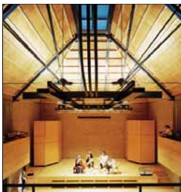
Jacqueline du Pré Music Building