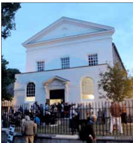
Holywell Music Room

The Oxford Philharmonic Orchestra gratefully acknowledges the support given by St Hilda's College to our Oxford Piano Festival and the warm hospitality they extend to our faculty, staff and students.