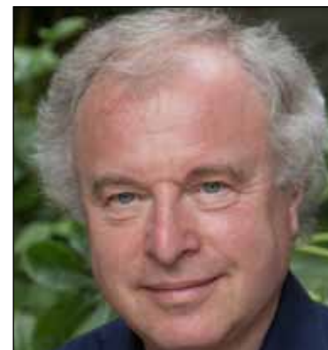
Sir Andrés Schiff