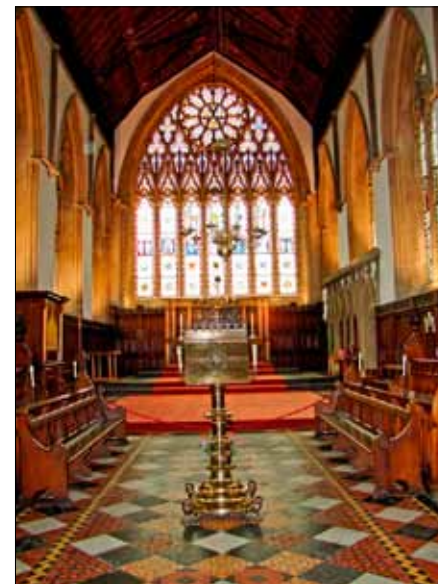
Merton College Chapel

Certificates: Certificates of Attendance will be presented to full-time participants and observers at the end of the Festival.