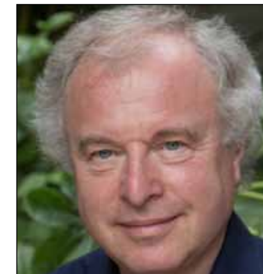
Sir Andrés Schiff

12.45-13.00 JdP, St Hilda's College Presentation of Certificates