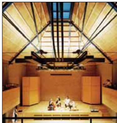
Jacqueline du Pré Music Building