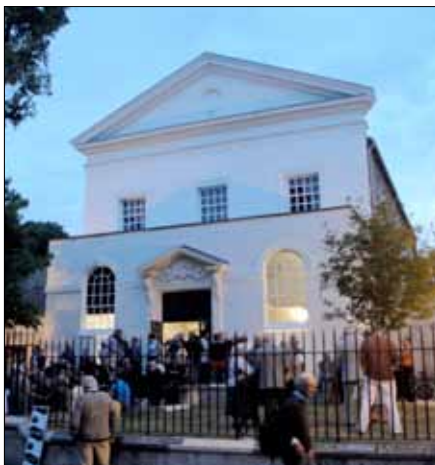
Holywell Music Room

The Oxford Philharmonic Orchestra gratefully acknowledges the support given by St Hilda's College to our Oxford Piano Festival and the warm hospitality they extend to our faculty, staff and students.