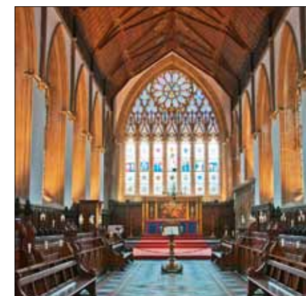
Merton College Chapel

Certificates: Certificates of Attendance will be presented to full-time participants and observers at the end of the Festival.