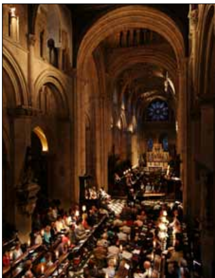
Christ Church Cathedral

29 June application and payment deadline