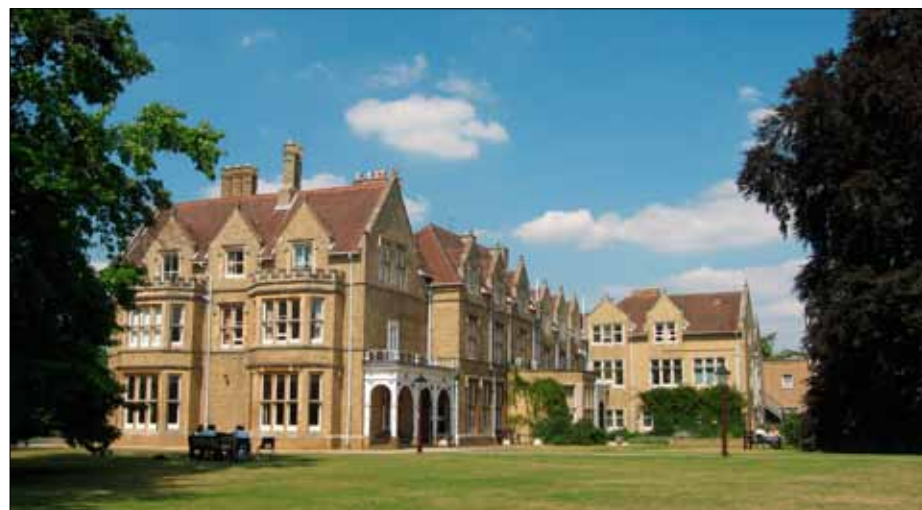
St Hilda's College